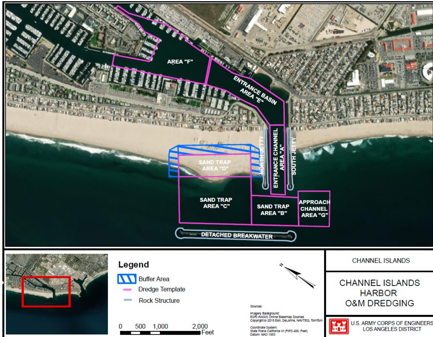
Figure 1: Dredge Template and Buffer Area